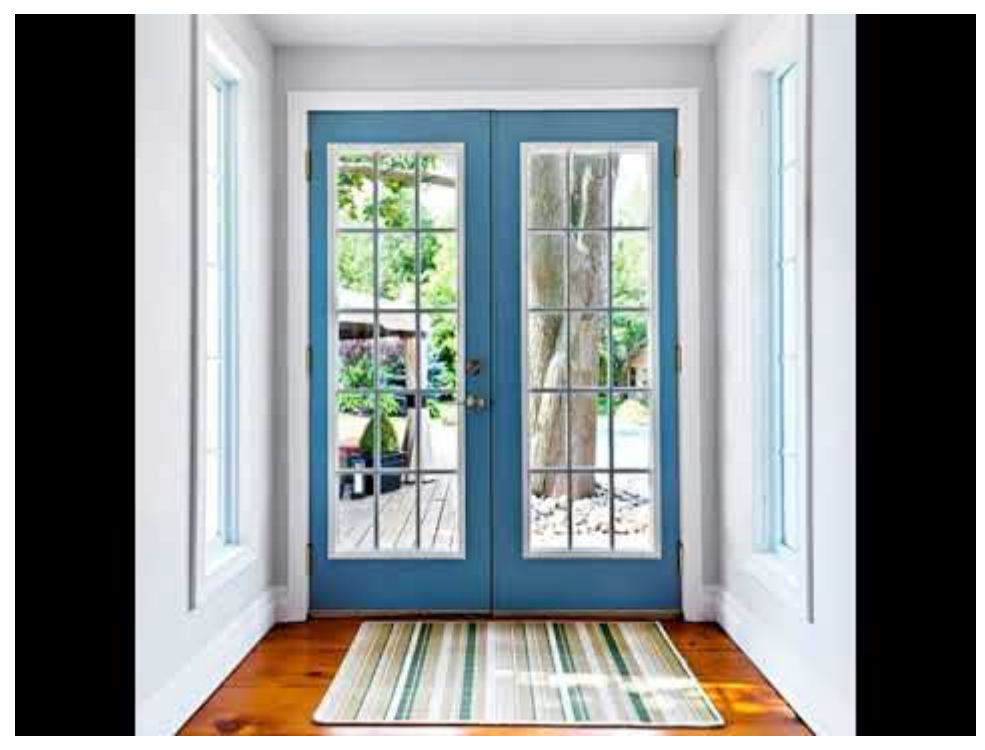
Watch Video At: https://youtu.be/EiLgQopVTPU

Every one of our windows and doors, including our exterior French doors, are Enviro-Sealed, and Eco-View windows and glass, which are backed and certified by <u>Energy Star</u>, and AAMA. Bring the beauty of the Arizona desert into your home without risking your heating and cooling efficiency with beautiful, Energy Shield Window & Door Company high quality French doors.